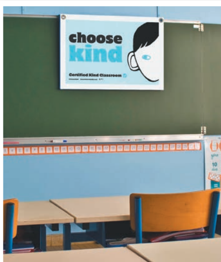
Illustrations © 2012 R.J. Palacio