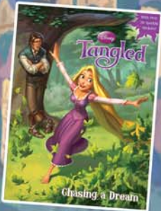
DELUXE COLORING BOOK