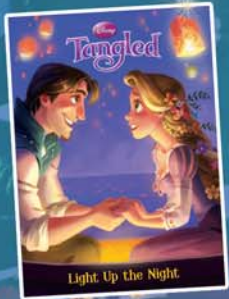
HOLOGRAMMATIC STICKER BOOK