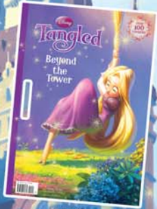
GIANT COLORING BOOK