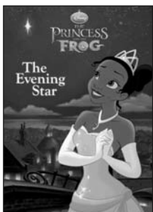
Deluxe Coloring Book