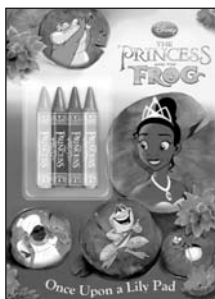
Coloring Book plus Crayons

Look for more coloring and activity fun from Random House Children's Books wherever books are sold!