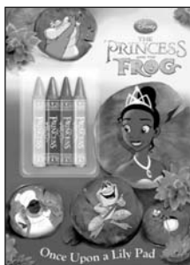
Coloring Book plus Crayons

Look for more coloring and activity fun from Random House Children's Books wherever books are sold!