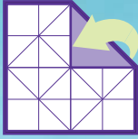
Step 1: Fold each outside corner toward the center.

Before you start folding, make sure the blank side of the paper is facing up towards you.