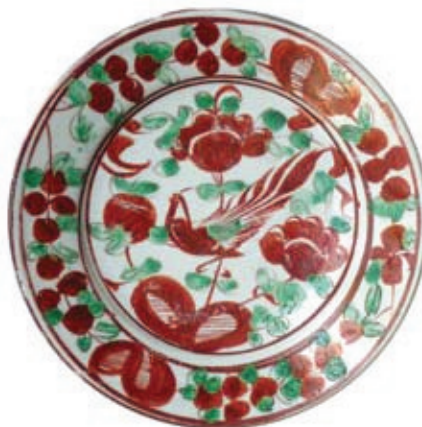
Dish, Swatow ware ( gosu aka-e ), diameter 16.5 cm, ca. 1600-1620