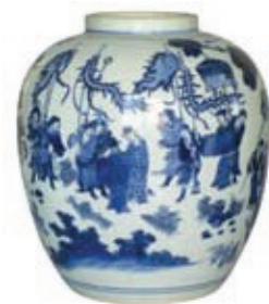
Vase, Jingdezhen, transitional ware, height 22.6 cm ca. 1628-1644

Goro Shimura is a Michael Henry Strater University Professor Emeritus in the Department of Mathematics at Princeton University. He has been studying and collecting Imari for more than 30 years (his tips for collectors are included in the book). He lives in Princeton, New Jersey.