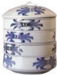
Danjū (round container in a tier), Arita, diameter 16.4 cm (lid), ca. 1736

With more than 300 stunning full-color photographs alongside an insightful discussion of a centuries-old art, The Story of Imari offers a fascinating look at one of the world's most prized porcelains.