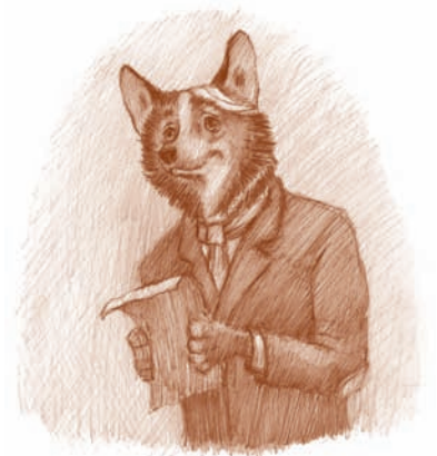
Illustration © 2007 by Christian Slade