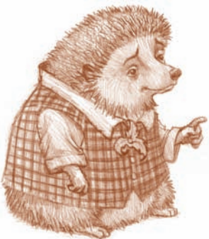
Illustration © 2007 by Christian Slade

EDUCATORS: Reproduce this activity sheet to use with your students.