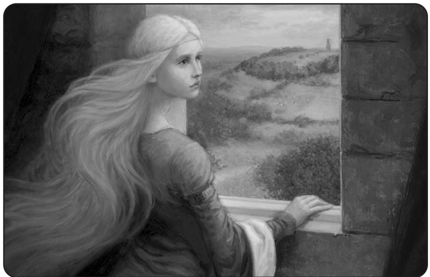
Illustration © 2008 by Tristian Elwell